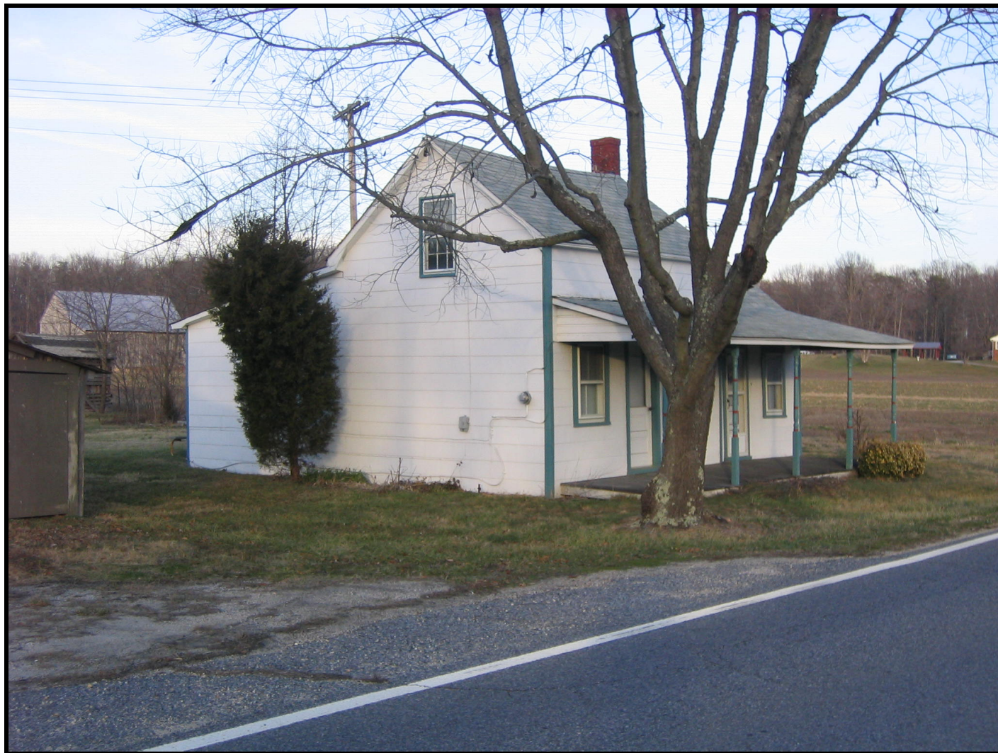
Photo: Garner-Hyde House, c. 1870, view of the west (side) elevation, looking northeast. (January 2008)