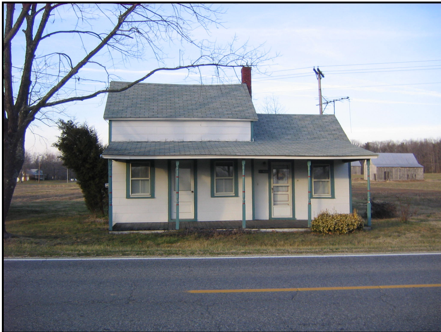
Photo: Garner-Hyde House, c. 1870, view of the façade (south elevation), looking north. (January 2008)