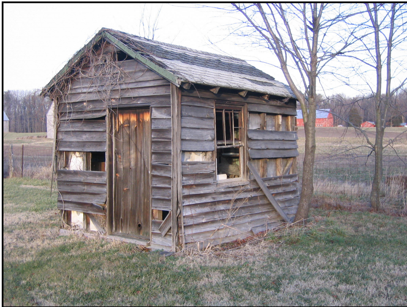
Photo: Shed (2), c. 1950, view of the southwest corner, looking northeast. (January 2008)