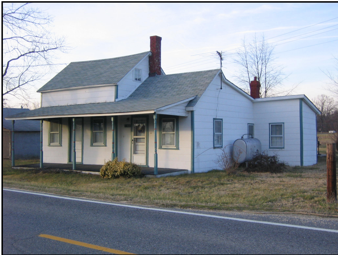
Photo: Garner-Hyde House, c. 1870, view of the southeast corner, looking northwest. (January 2008)