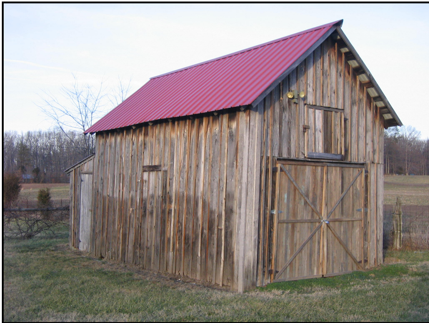
Photo: Stable, c. 1925, view of the southwest corner, looking northeast. (January 2008)