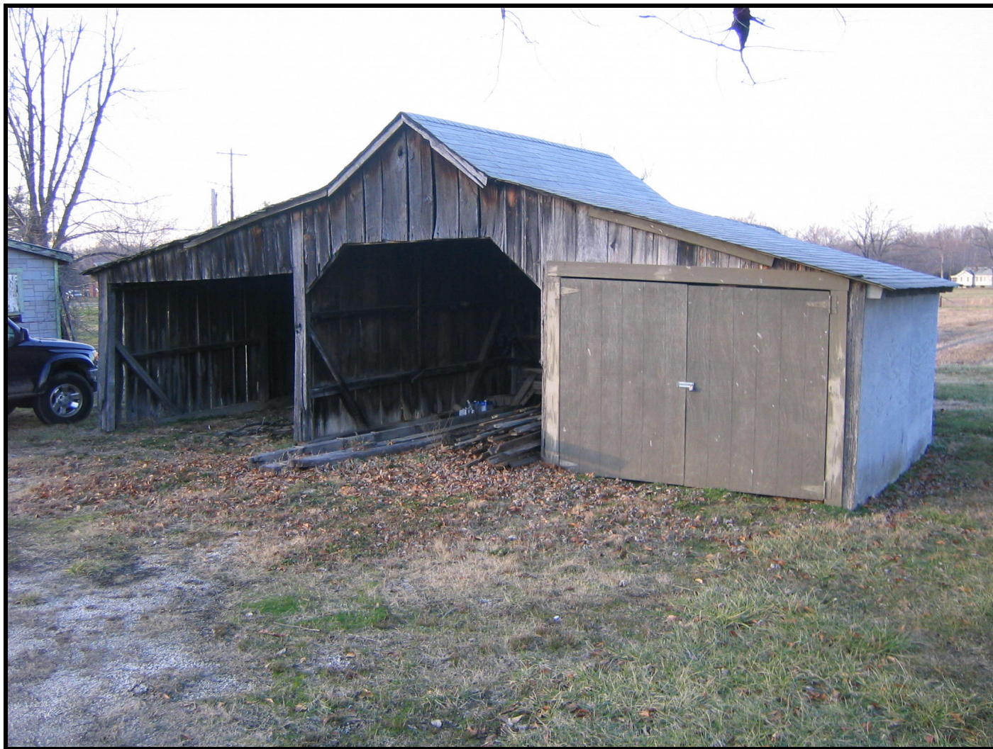
Photo: Garage, c. 1925, view of the façade (south elevation), looking northwest. (January 2008)