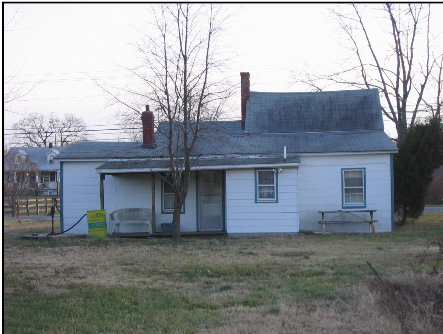
Photo: Garner-Hyde House, c. 1870, view of the north (rear) elevation, looking south. (January 2008)